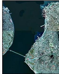
Satellite view of The Narrows and the Verrazano-Narrows Bridge.