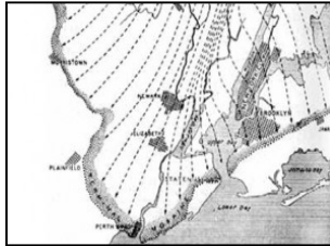
Location of the terminal moraine of the continental glacial.